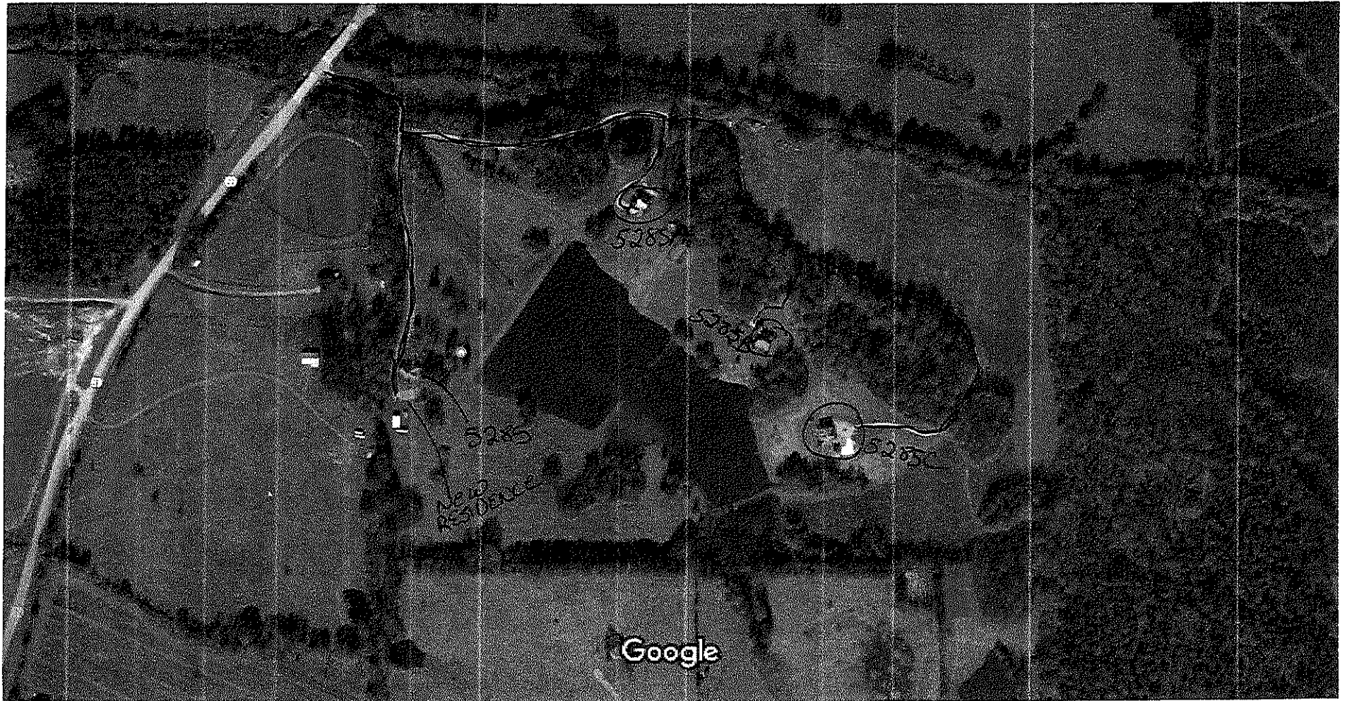
200 ft